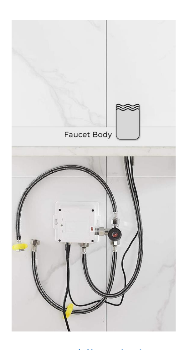
Visit product Page